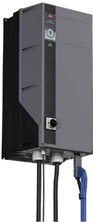
The PTU 025 is easily mounted into the FC 102 drive enclosure, and provides 360° access for optimal tube connections.

It is easily mounted into the enclosure of the VLT® HVAC Drive, and retrofitted existing drives.